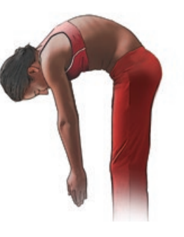
Fig. 6 Abnormal